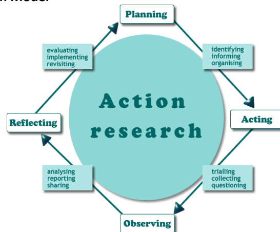
Figure 2: Action Research Model