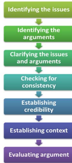
Figure 1: Critical Reflection Model