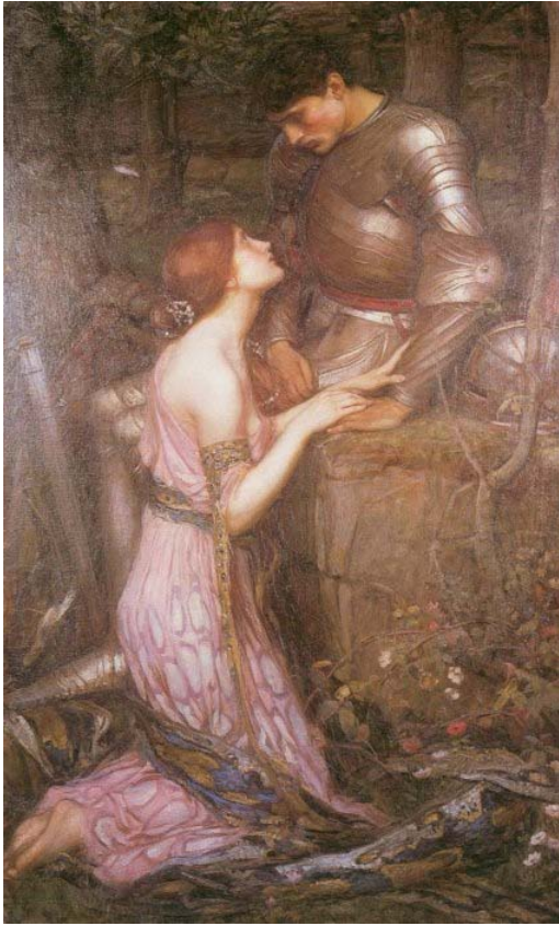
'Lamia (On Her Knees)' – 1905