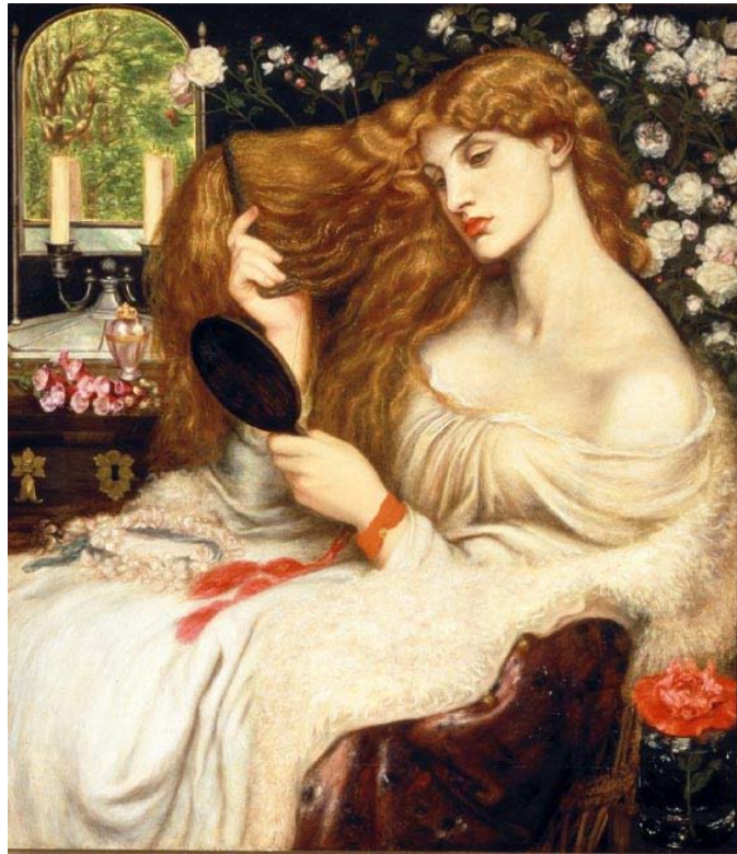
'Lady Lilith' - 1867 Dante Gabriel Rossetti (1828 – 1882)