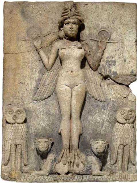
'Queen Of The Night' – The Burney Relief