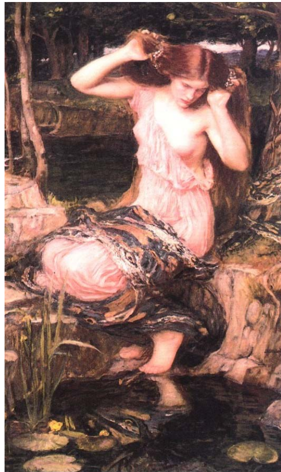
'Lamia (By The Pond)' - 1909