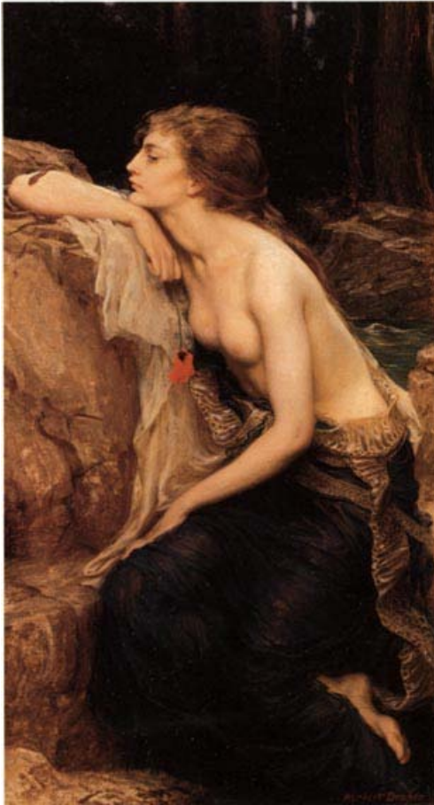
'Lamia' - 1909